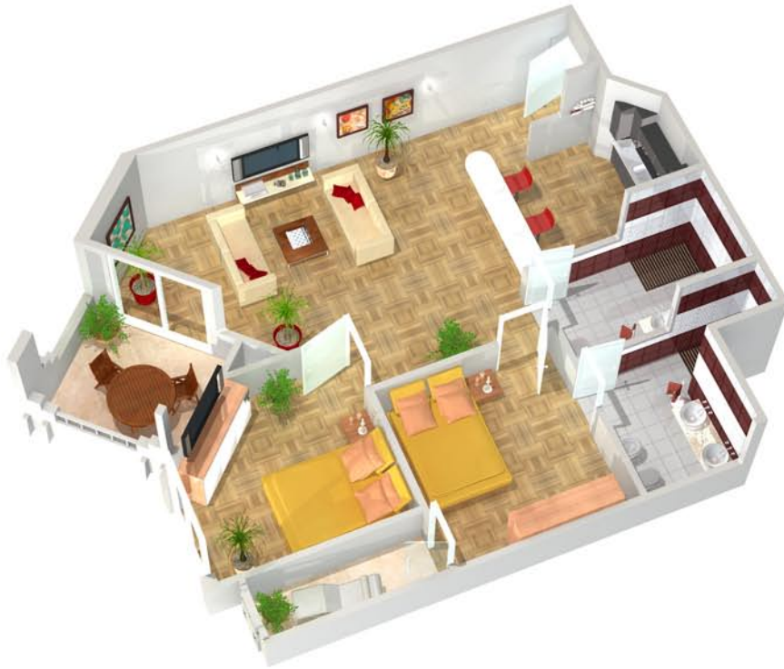
approx. 112 sqm