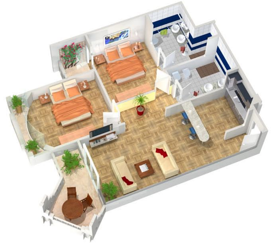
approx. 114 sqm