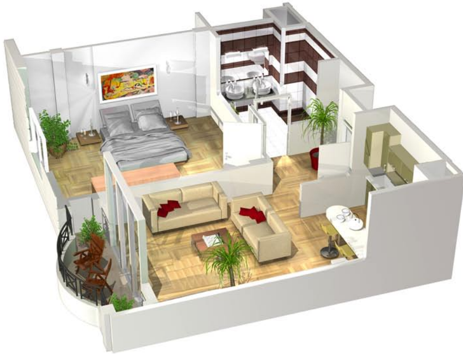
approx. 64 sqm