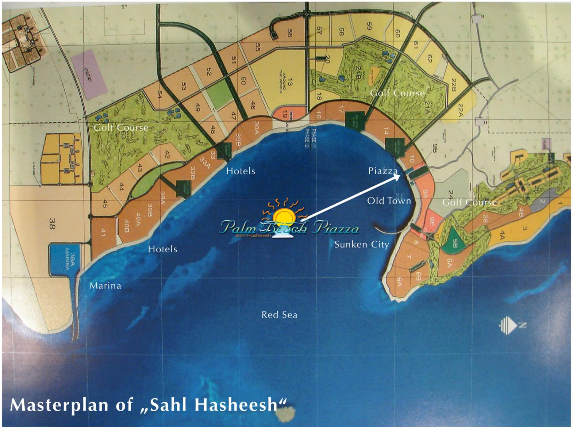
Masterplan of „Sahl Hasheesh“