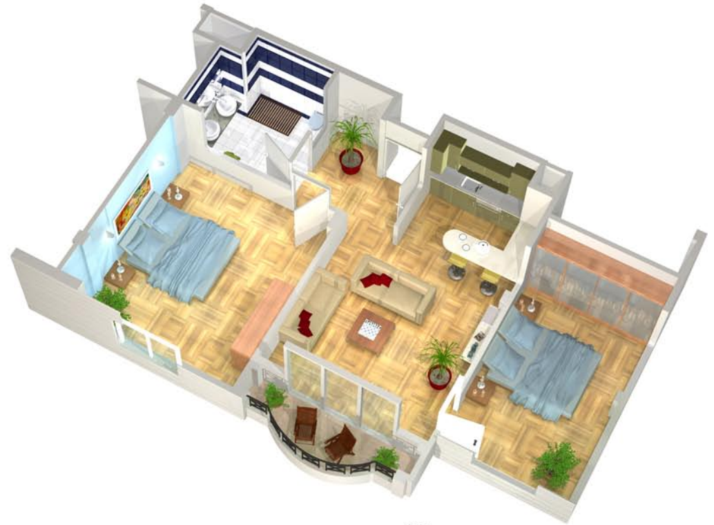
approx. 85 sqm